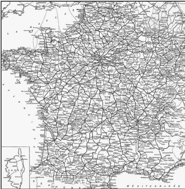
The French rail network in 1921 and 2018